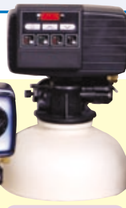
Fleck 5600 SE