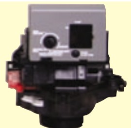
Autotrol 255 Metered