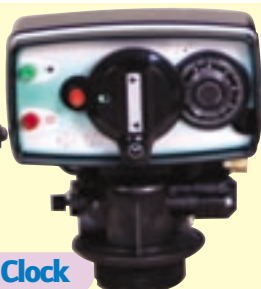
Fleck 5600 Metered