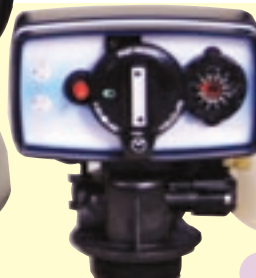
Fleck 5600 Time Clock