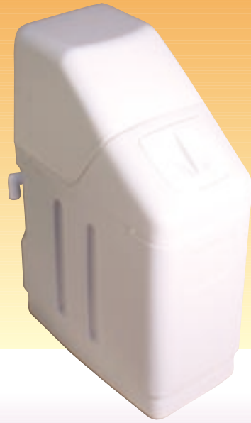
Titan & Hood