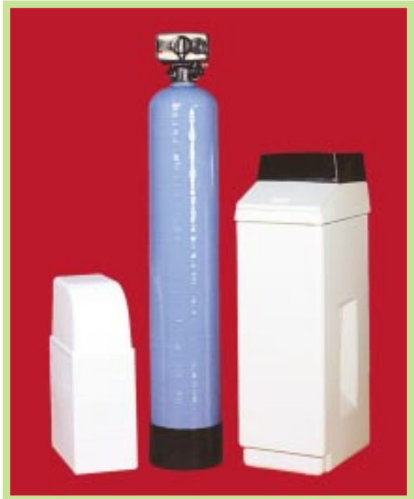
Fleck 5600 valved system shown between a Trojan and a Caribbean Cabinet.

For fixed or consistent flow rates a simple timer controlled valve will suffice. This will effect