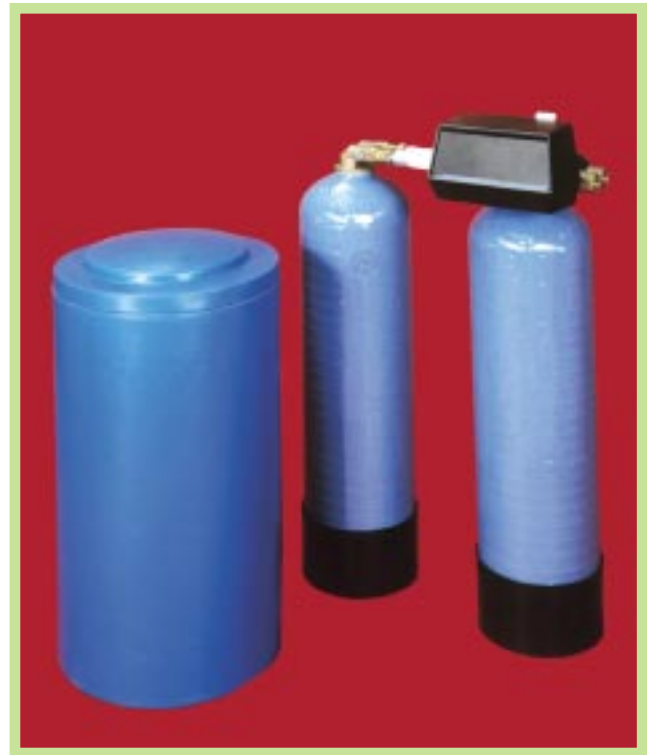
Fleck 9000 Duplex unit.

The capacity of a Nitrate removal unit is a function of the amount of resin in the column, the amount of Nitrate and Sulphate, and the amount of salt used at each regeneration. The output will therefore increase or decrease according to local circumstances and the salt dosage rate. The raw water can also change dramatically in composition depending on the season and weather conditions, so your water treatment specialist will take potential variations into account when fitting and programming your Nitrate Removal Unit.